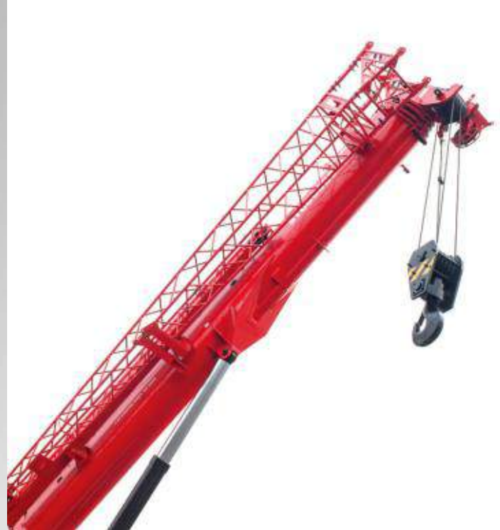
Five section boom welded by high-tensile steel plate, featuring good rigidity. Max. lifting height is lifted to 65m after mounting 17.5m fixed jib. Max. lifting moment 2881kN · m, capacity upgraded significantly.