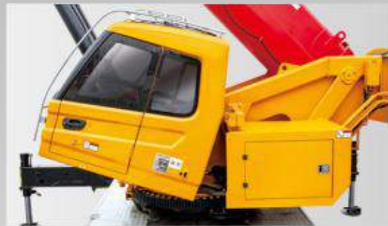
SANY 0~20° tiltable large indoor space cab, relieving fatigue in long time operation.