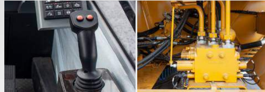
Control precision and stability are enhanced via new generation electrically controlled hydraulic system of electrical joystick and electro proportional main valve.