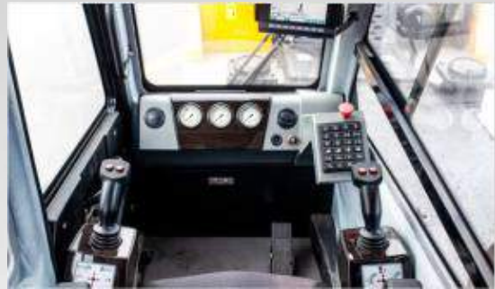
Standard 7" HD screen with LMI, load data in real-time display. All new membrane touch button panel tilted by 45°, status displayed, easy to operate. One button switch of eco and strong modes.