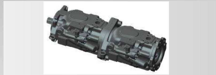
Sufficient power and high efficiency ensured by double piston pumps with large flow intelligent distribution system